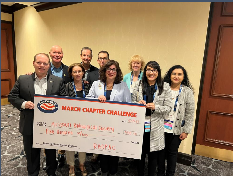
MISSOURI RADIOLOGICAL SOCIETY