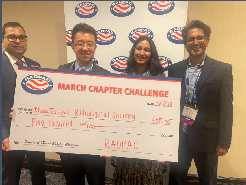
RHODE ISLAND RADIOLOGICAL SOCIETY