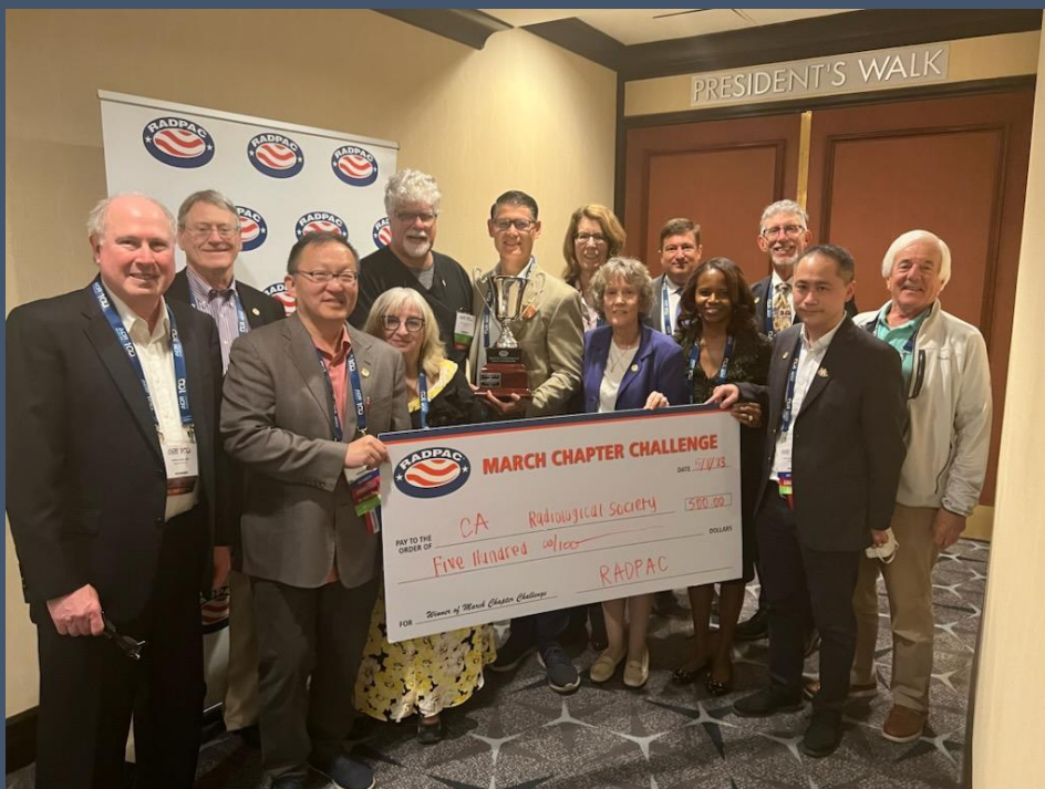
CALIFORNIA RADIOLOGICAL SOCIETY