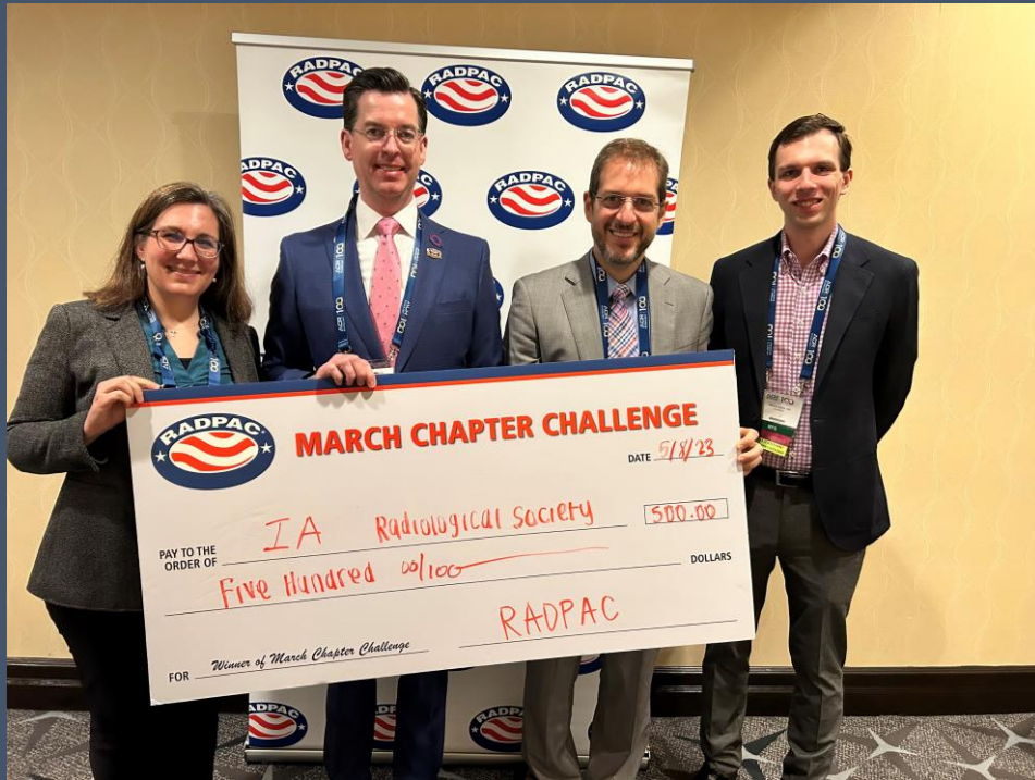
IOWA RADIOLOGICAL SOCIETY