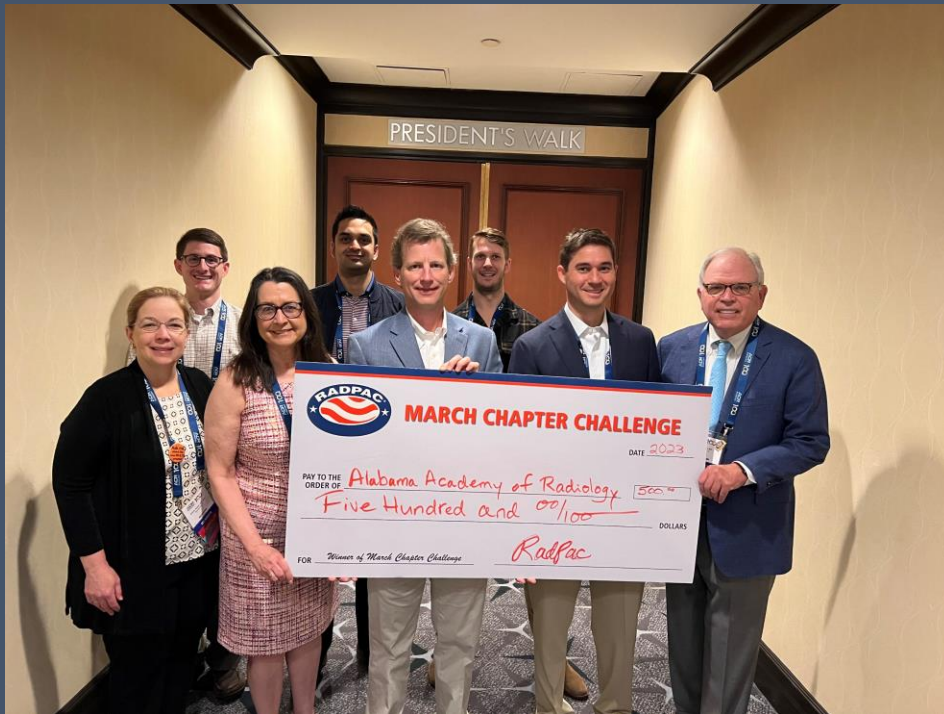
ALABAMA ACADEMY OF RADIOLOGY